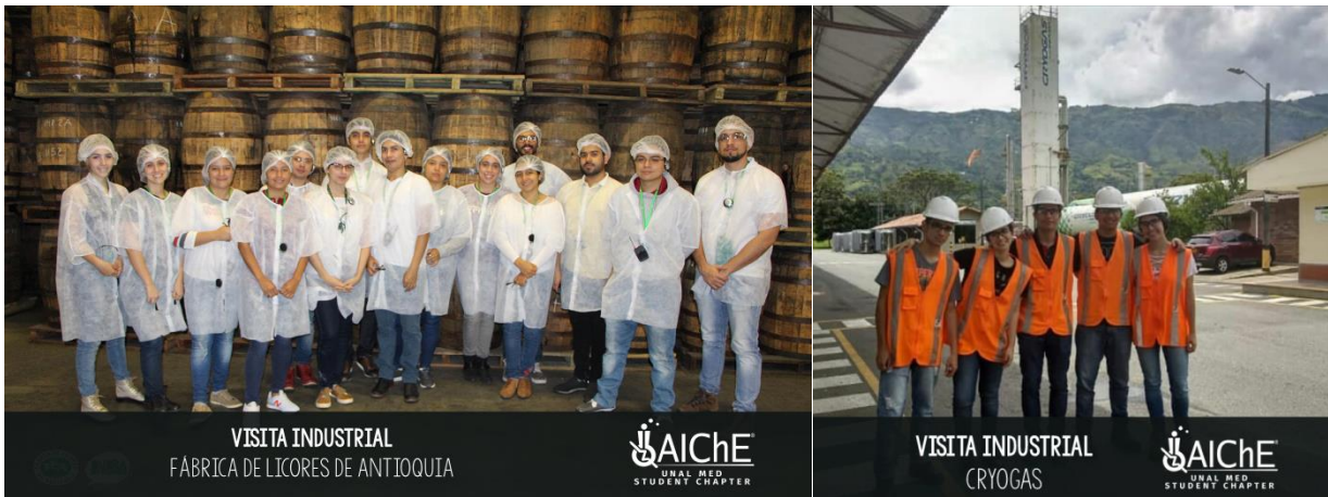
VISITA INDUSTRIAL FABRICA DE LICORES DE ANTIOQUIA