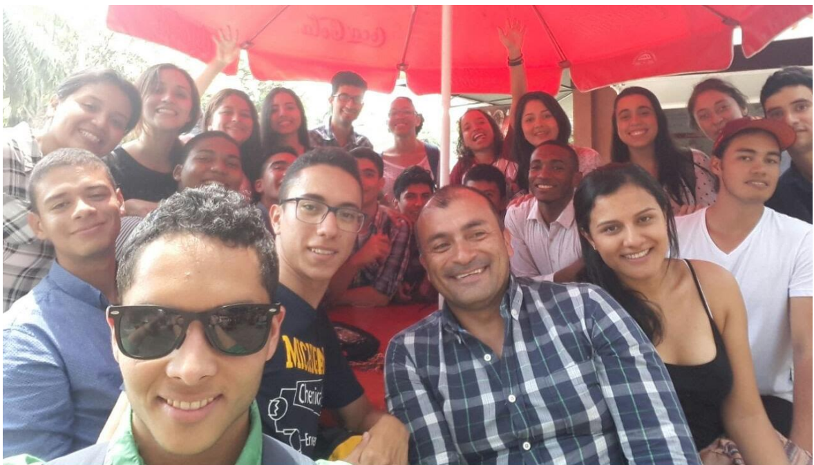
VISITAS INDUSTRIALES POR FUERA DE MEDELLÍN: CALI