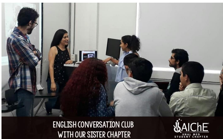
ENGLISH CONVERSATION CLUB WITH OUR SISTER CHAPTER