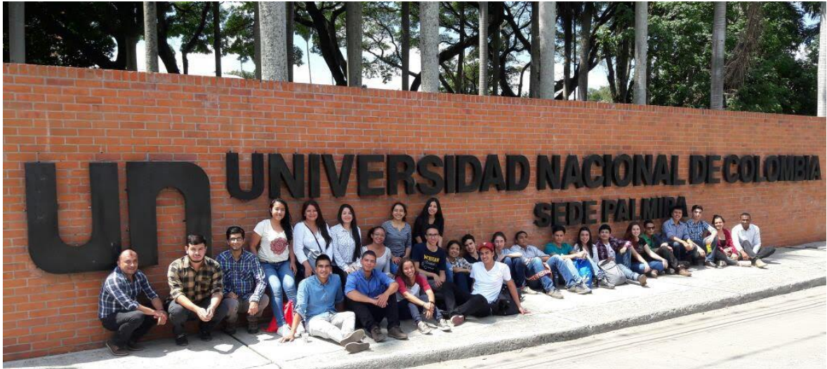
VISITAS INDUSTRIALES POR FUERA DE MEDELLÍN: CALI UNIVERSIDAD NACIONAL DE COLOMBIA SEDE PALMIRA

Additionally, we visited the Palmira Campus of our university and enjoyed some cultural plans in Cali City and its surroundings.